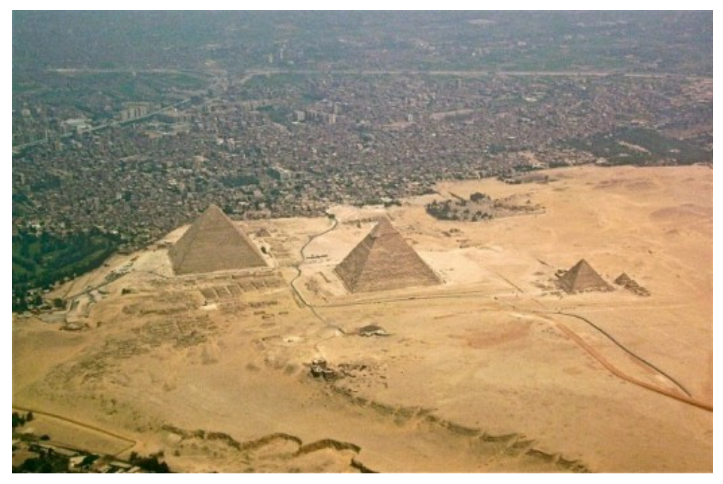
Figure 3: Great Pyramids of Gizeh

the Sumerians, entertainers and the king seated in a throne shown larger than life -- all of which boast about Sumeria. When carried into war this would remind the Sumerians of their own might and strike fear into their enemies. Babylon, another powerful Ancient Near Eastern civilization, birthed the Code of Hammurabi (Figure 2). It features 282 engraved laws and their respective punishments, along with a depiction of King Hammurabi and Shamash, the god of justice. Shamash is handing the king a scepter, ring, and a rope, all of which symbolize his power. This combined cuneiform and sculpture piece clearly had political motives and was meant to display the immense role of laws in Babylonian society, as well as reminding citizens that King Hammurabi was given his power by the gods themselves. These laws were no laughing matter and this seven-and-a-half foot stone stele signifies their importance. Even in the Ancient Near East, fledgling civilizations employed art in order to demonstrate the power of their nation and to unify their citizens.