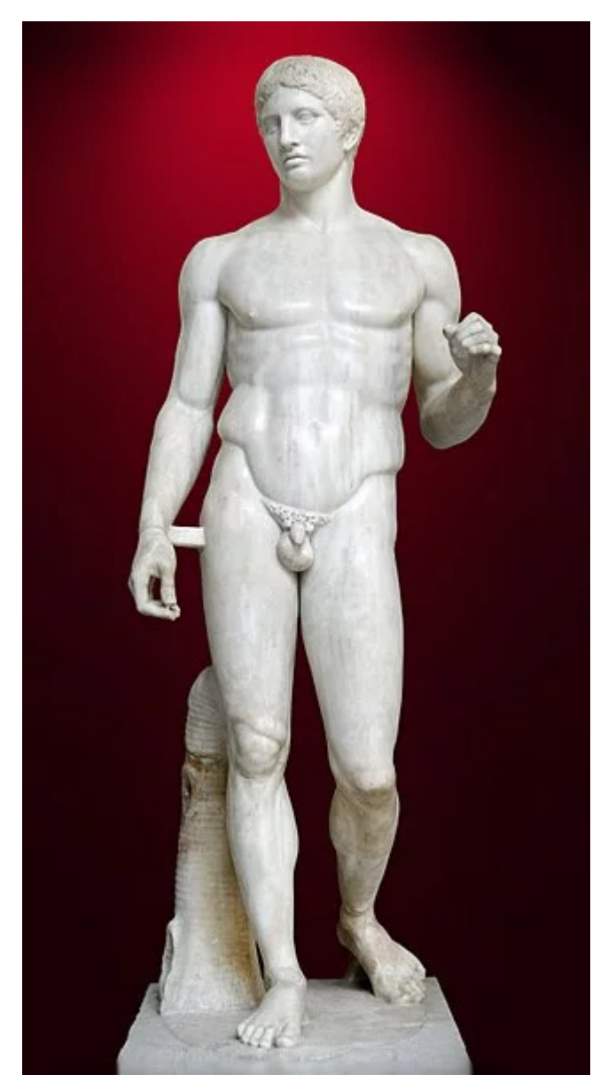
Figure 6: Doryphoros/Spear-Bearer