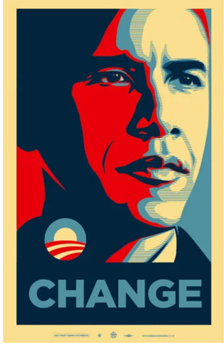
A Modern Example of Art With a Message | Source