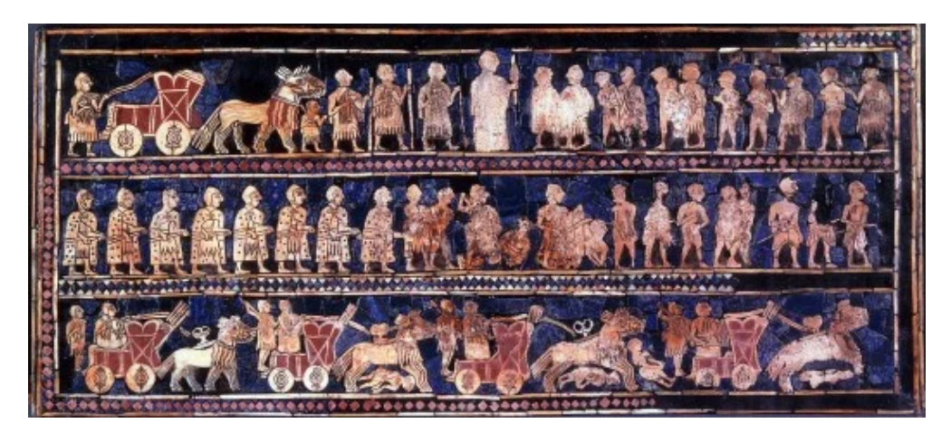
Figure 1: Standard of Ur

Propaganda, as defined by Merriam-Webster, consists of "ideas or statements that are often false or exaggerated and that are spread in order to help a cause, a political leader, a government, and so on." For centuries, art has been wielded by oppressive governments and power-hungry leaders in order to further their own selfish motives, as well as to simply promote the greater good of a society. Crafting art is a primary way in which people can express their love of something; what better way to express their love for their nation than through art that can stand the test of time. While propaganda often manifests itself in writing, film, speech, government and news reports, and the rewriting of history, it can most powerfully depicted through pieces of art. Paintings, sculptures, architecture, metalwork, and drawing can all be manipulated to portray a message that the artist wishes others to consider. Propaganda exists through art before the invention of writing, and can be traced namely through the Ancient Near Eastern, Egyptian, and Greek cultures.