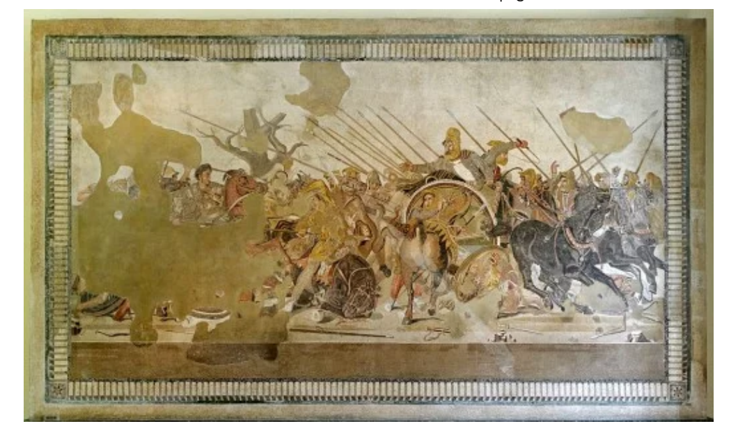
Figure 5: Alexander Mosaic from the House of Faun