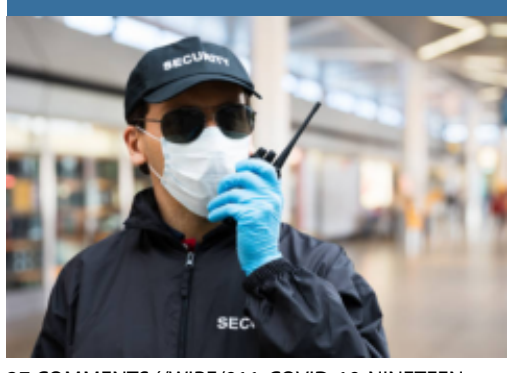
37 COMMENTS (/WIRE/911-COVID-19-NINETEEN-YEARS-PERMANENT-EMERGENCY#DISQUS_THREAD)

TAGS Big Government (/topics/big-government), U.S. History (/topics/us-history), War and Foreign Policy (/topics/war-and-foreign-policy)