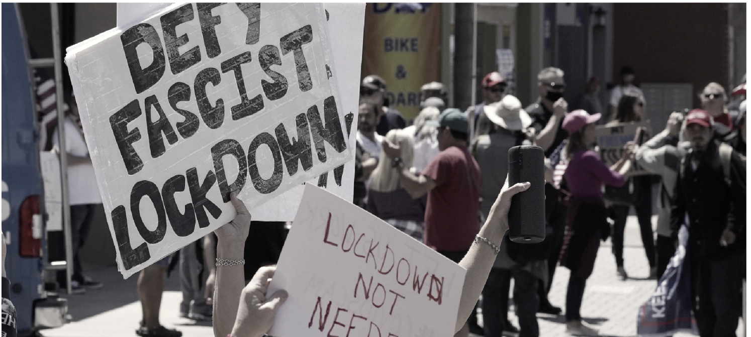
Protesters demonstrate against stay-at-home orders in California, April 2020

C OVID 19 is being used to create a global fascist dictatorship. From New Zealand to the the U.S, so called western democracies have adopted and developed the Chinese model of technocracy to create a single biosecurity State.